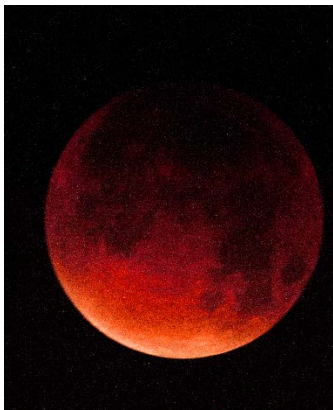
Lunar Eclipse from the pub