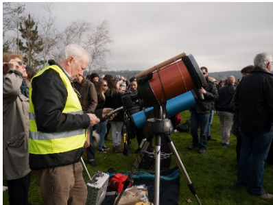
Solar Eclipse at Blackrock