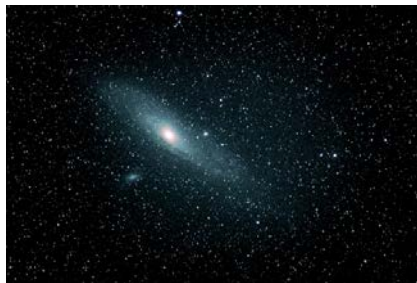
Andromeda using a large telescope