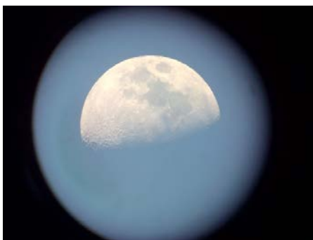
The moon through the eyepiece