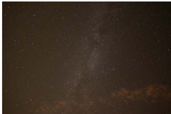
Milky Way from the Garden